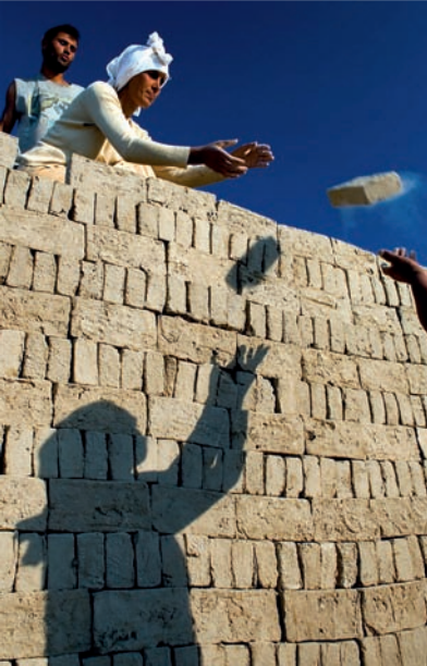
BRICKMOULDERS ARE GYPSIES WHO ARE VERY PROUD OF THE CRAFT THAT THEY'VE INHERITED FROM THEIR FOREFATHERS. THIS WOMAN IS MAKING TIGHT THE WALLS OF THE KILN.

Different features of current European labour markets can prevent or undermine decent work 6 , including: